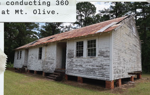
Modern day Mt. Olive School.