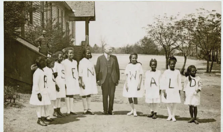
Julius Rosenwald with students from a Rosenwald school.