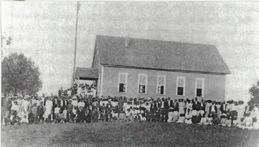
Loachapoka School in Alabama, the first Rosenwald School, completed in May 1913.

As the Rosenwald Schools program expanded, Booker T. Washington, Robert R. Taylor, and Julius Rosenwald worked together to develop and implement its strategies. Washington served as an advisor and provided guidance on the educational needs and challenges faced by African American communities . Taylor, with his architectural expertise , designed school buildings that were functional, cost-effective, and well-suited to the rural areas they served .