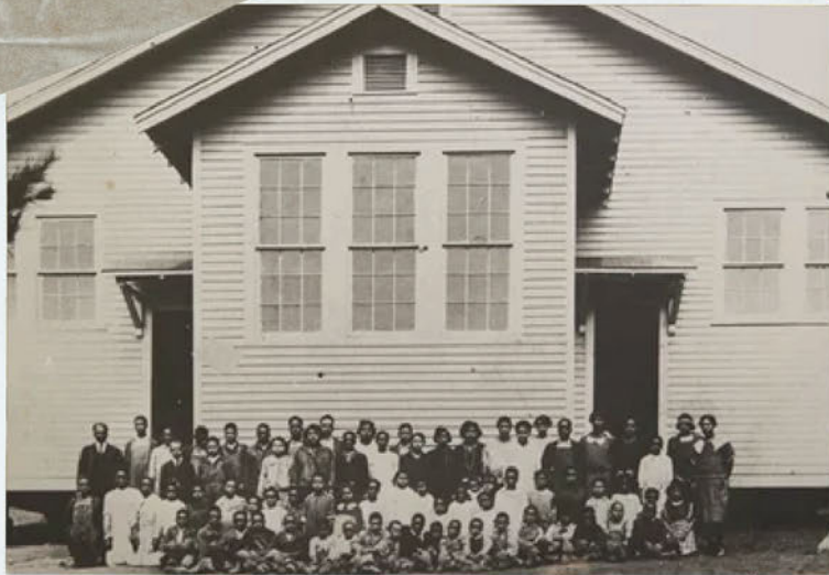
Students and teachers at the Noble Hill School in Cassville, Ga., in 1925.

Julius Rosenwald was a Jewish-American businessman and philanthropist who became the president of Sears, Roebuck and Company, a major retail company in the early 20th century. Rosenwald was deeply committed to addressing social and educational inequalities faced by African Americans . He met Booker T. Washington in 1911 and was inspired by Washington's vision for African American education.