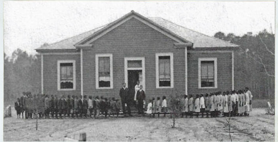
Rosenwald School in Chehaw, AL, one of the first six Rosenwald Schools to be built, completed in 1914.