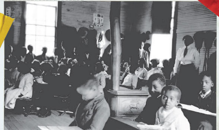
Students of varying ages sit in a classroom at a Rosenwald school in Chesterfield County.