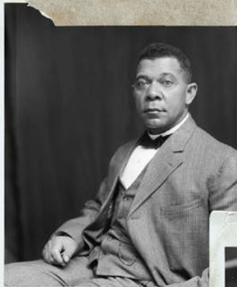
Booker T. Washington