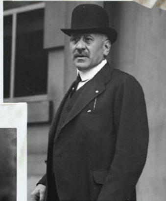
Julius Rosenwald