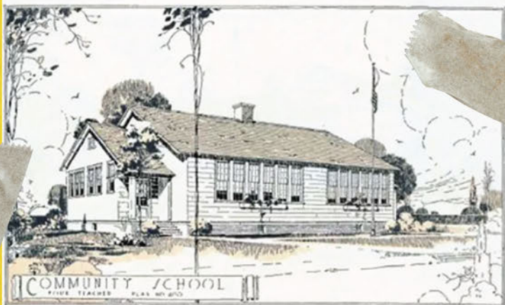
COMMUNITY SCHOOL PLANS

Community School Plans, Bulletin No. 3, the Julius Rosenwald Fund. 1924.