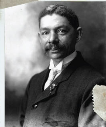
Robert R. Taylor (Tuskegee University)

Booker T. Washington , Robert R. Taylor , and Julius Rosenwald all played significant roles in the development and implementation of the Rosenwald Schools program , which aimed to provide educational opportunities for African American children in the Southern United States during the early 20th century.