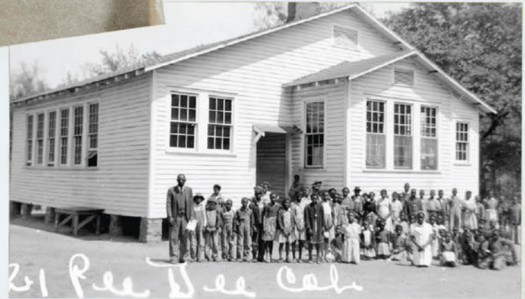
21 Pee Dee Cal Pee Dee Rosenwald School, Marion County, South Carolina, c. 1935.

Robert R. Taylor was the first professionally trained African American architect in the United States. He studied at the Massachusetts Institute of Technology (MIT) and became the head of the architecture department at Tuskegee Institute . Taylor worked closely with Booker T. Washington and played a crucial role in the design and construction of the Rosenwald Schools.