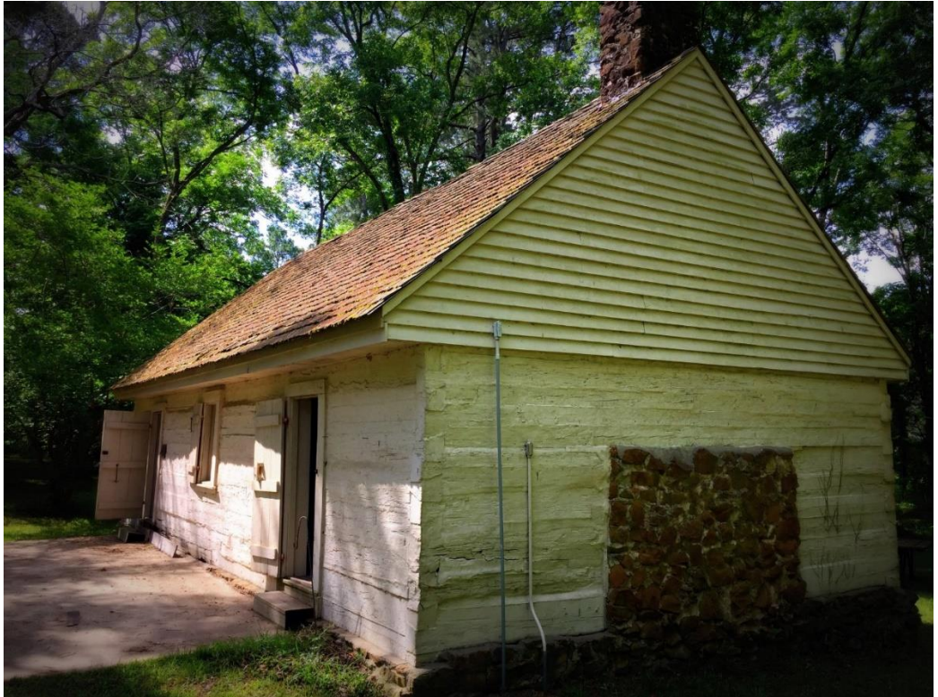
Fort Jesup Kitchen, 2017.