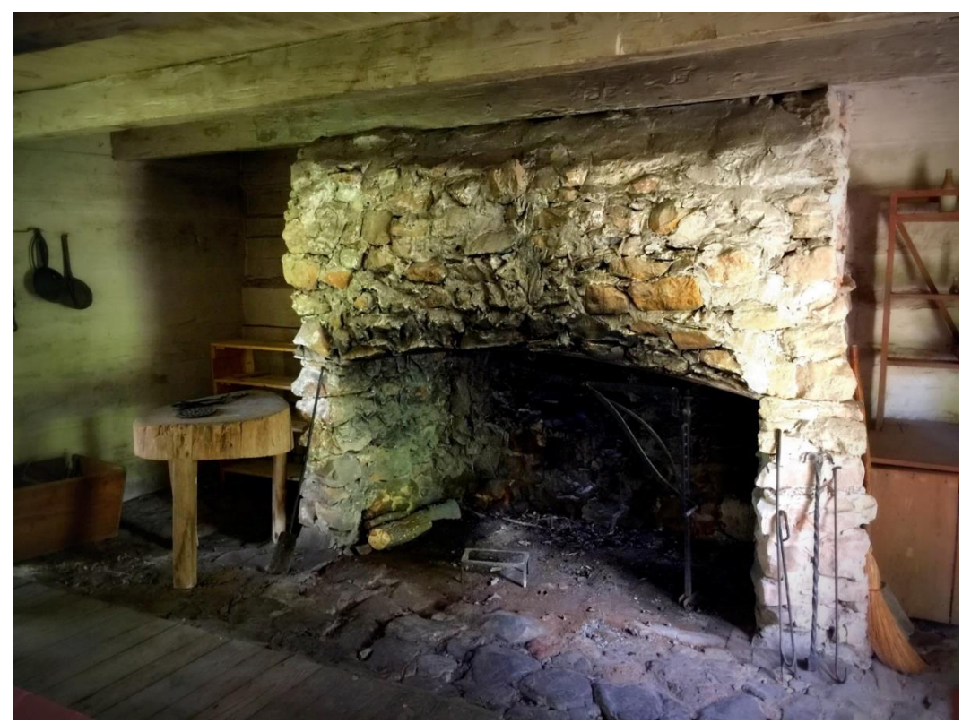
Fireplace and hearth, 2017.