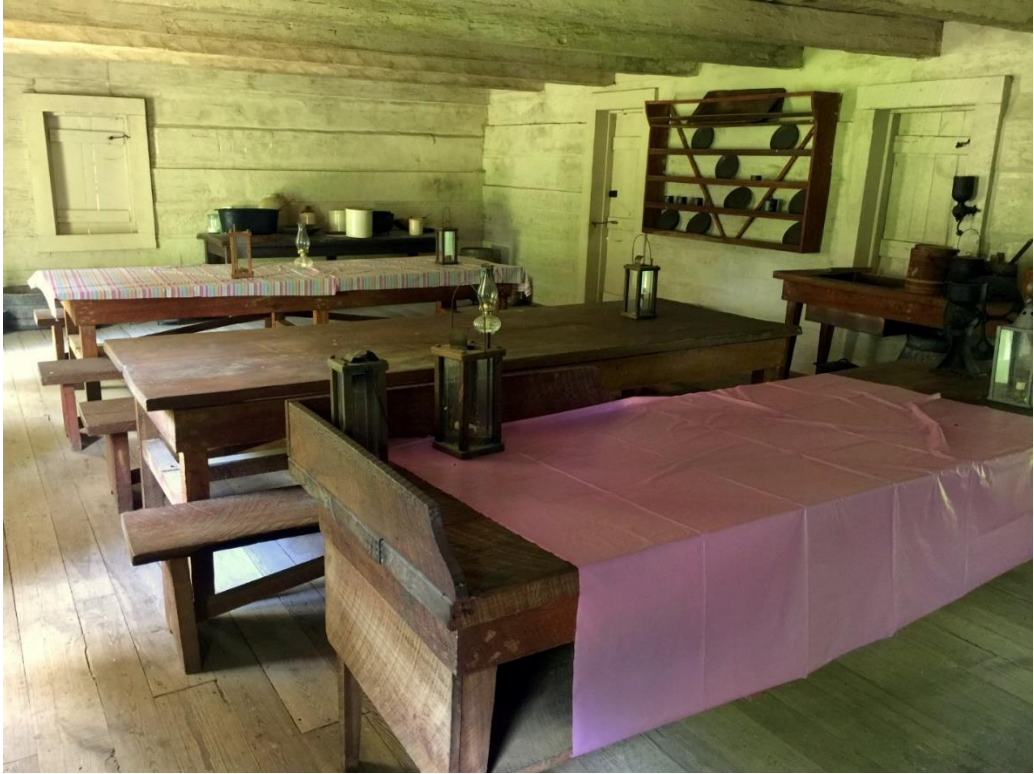
Interior of Fort Jesup Kitchen, 2017.