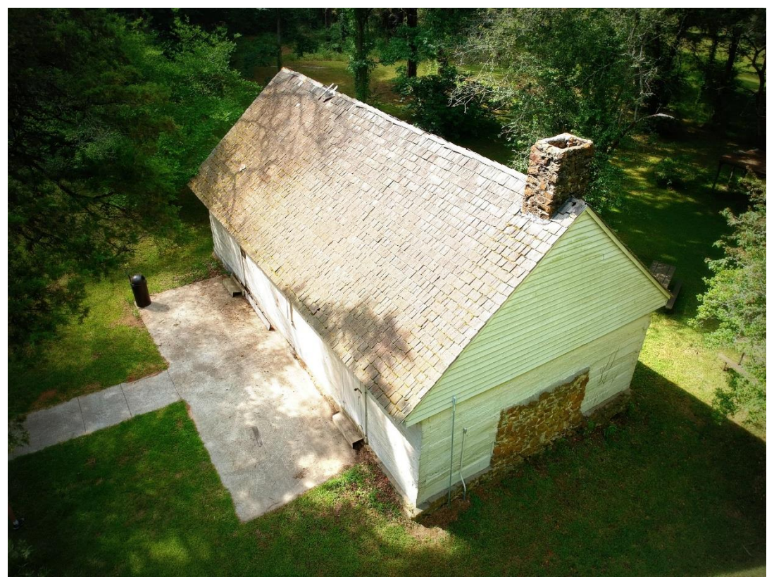
Fort Jesup Kitchen from above, 2017.