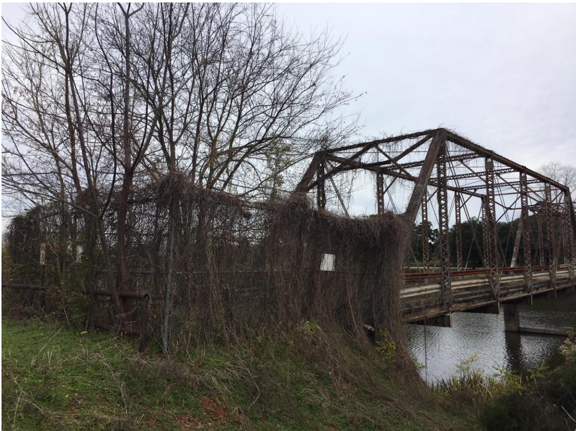
Bermuda Bridge, looking northeast from Highway 119/494, December 2018.