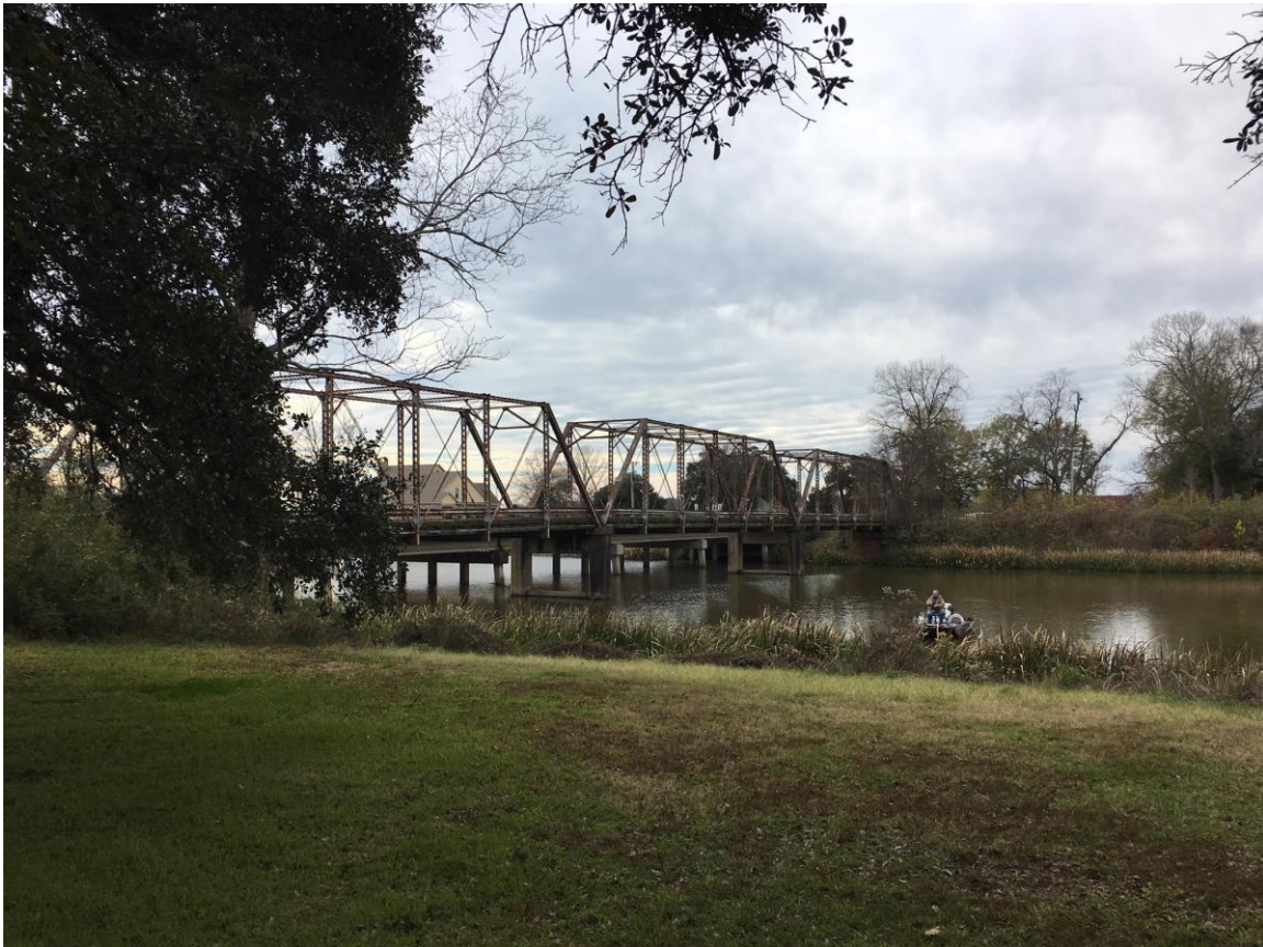
Bermuda Bridge, looking southwest from Parish Road 610, December 2018.