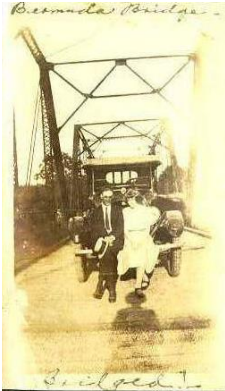
Bermuda Bridge, circa 1920s.