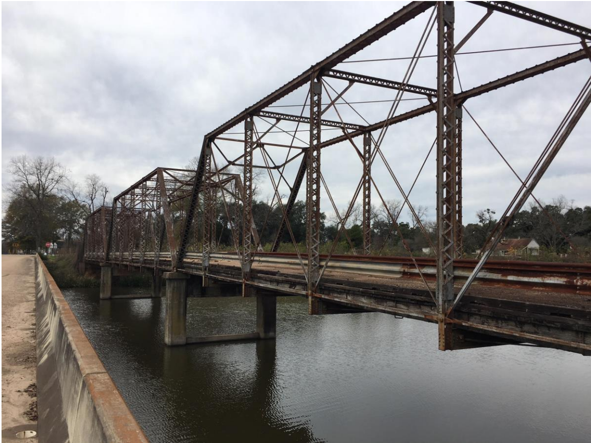
Bermuda Bridge, looking west from Highway 119, December 2018.